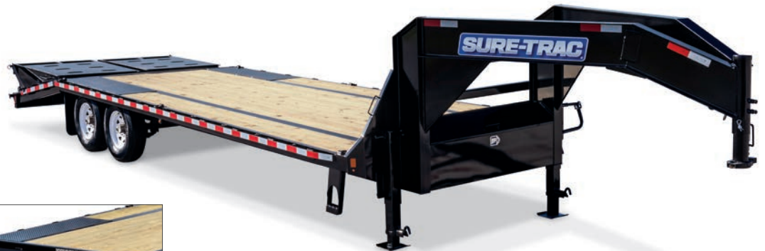
Shown with Optional Heavy-Duty I-Beam Gooseneck