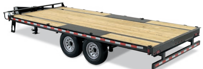
Also Available in a Flatbed Model