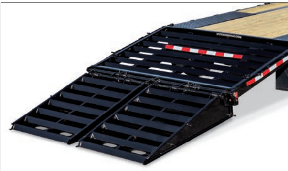
Shown with Universal Full-Width Ramps (Option)