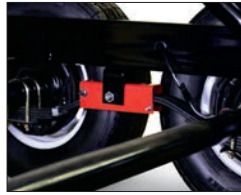
Slipper Spring Suspension 14K and Up