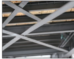
Cross Trac Bracing