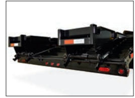
Tube Constructed Bumper, Enclosing All Wires for Full Protection