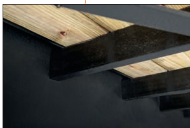
Pierced Frame for Lower Deck Height and Undercoated Main Frame